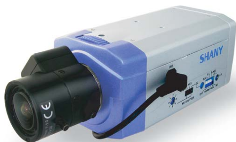
Multi-speed Shutter Designed for Capturing Car License Plate